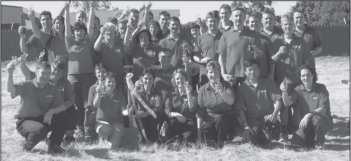
REDARC employees celebrate the turning of the first sod

On 4th December, 2006, Redarc employees celebrated the "turning of the first sod" and the anticipated date of completion is mid August, 2007.