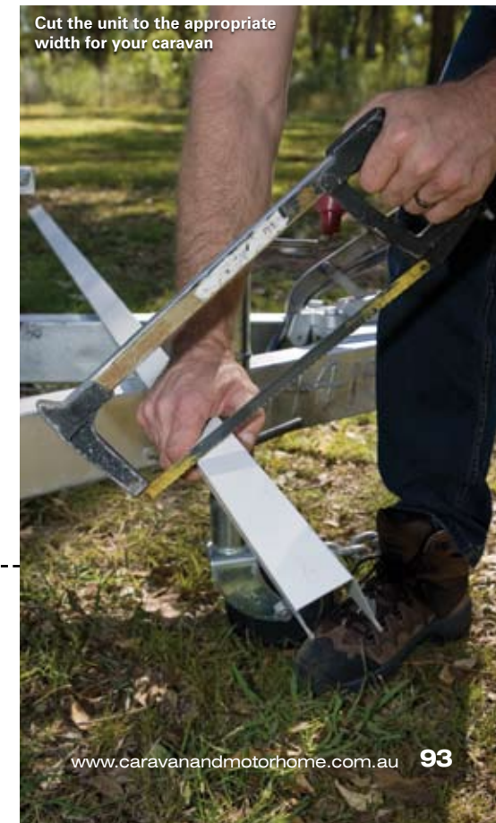
Cut the unit to the appropriate width for your caravan